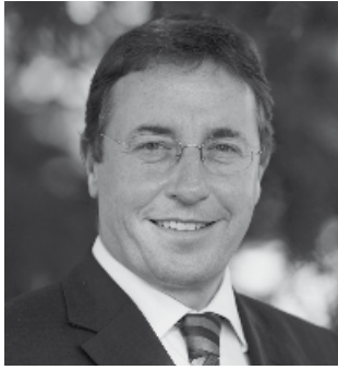
Achim Steiner

“If targets for greenhouse gas (GHG) emissions reduction are to be met, decision-makers must unlock the potential of the building sector with much greater seriousness and vigor than they have to date and make mitigation of building-related emissions a cornerstone of every national climate change strategy. Together, we must raise awareness of the important role of this sector as a priority in meeting national GHG emission reduction targets. We must form national and regional baselines for building-related emissions using a consistent international approach, such as the Common Carbon Metric to measure, report, and verify performance.