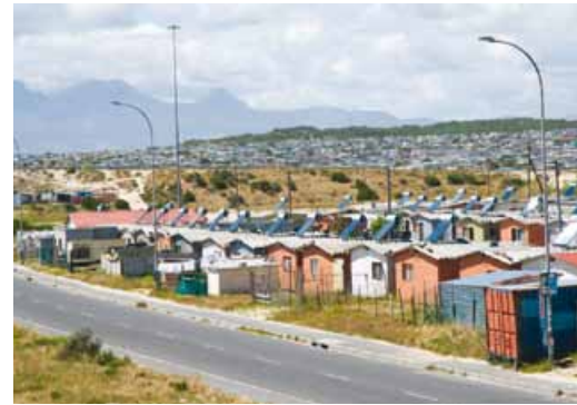
The Kuyasa CDM project entailed the retrofitting of 2,300 homes with solar water heaters, insulation and energy efficient light bulbs.

The community was involved throughout the design and construction process, and all construction workers received training, which was designed such that workers would learn both specific skills and a general problem-solving approach which would be transferable. Components of the building were designed so that they could be supplied by local small enterprises: brick recycling, door and window manufacture, burglar bars, reed ceilings and landscaping were "outsourced" to local enterprises. Material suppliers were assessed for compliance with fair labour practice and support for 'historically disadvantaged' individuals (ie individuals who were discriminated against under the 'apartheid' regime). Technology used was appropriate to the skills level of the community.