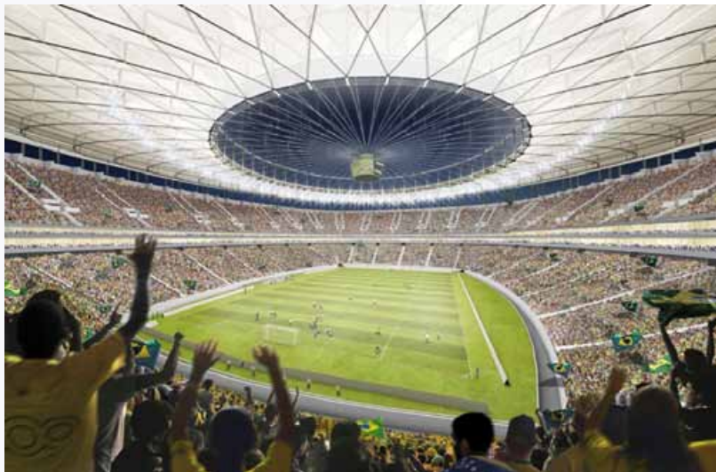
The new National Stadium in Brasilia is currently seeking LEED certification. Credit: Castro Mello Architects