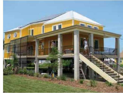
One of many homes being built by Make It Right New Orleans, the post-Hurricane Katrina housing initiative.

After Katrina hit New Orleans in 2005, USGBC organized a charrette on Gulf Coast Reconstruction which resulted in The New Orleans Principles – a consensus-based document that identified specific strategies for a sustainable rebuilding effort. The principles represented a consensus among the 160 participants, including residents of New Orleans, along with experts in urban planning, waste and water management, engineering, and architecture. One of the central themes of the Principles was inclusivity; recognizing that local community involvement and investment is at the core of any effort to build or rebuild a city.