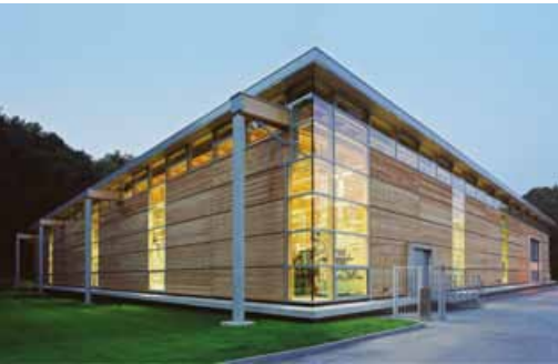
Sahna Industrial Building, DGNB Gold, Großharthau - Schmiedefeld.

Many of the social and economic priorities in Germany are closely linked to the environment, such as improving energy security and resource efficiency. Germany is seen as one of the environmental leaders in Europe and key goals include strengthening water infrastructure, improving waste management, phasing out nuclear energy, encouraging the use of renewables and discouraging the use of environmentally harmful construction materials.